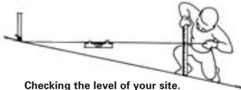
Checking the level of your site.